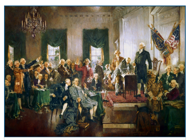
Howard Chandler Christy's 1940 painting, Scene at the Signing of the Constitution of the United States, hangs in the East Stairway of the House Wing of the U.S. Capitol Building in Washington, D.C. To learn more about the painting, go to <a href="https://www.aoc.gov/explore-capitol-campus/art/signing-constitution">https://www.aoc.gov/explore-capitol-campus/art/signing-constitution</a>.

The lessons that follow are stories about people's attempts to make the nation a more perfect union. Sometimes people understood explicitly that such perfection was their goal. Other times, they pulled on strands of U.S. history such as racial separation, gendered expectations, and suspicion of outsiders. Nor did Americans always realize exactly what they were doing at any given moment. But these ideas—these conflicts—are baked into our history, and show up again with some frequency. "A more perfect union" is at the end of a path that circles around and loops over itself. But no matter where we are on that road, our origins—heroic, shameful, and sometimes downright contradictory—are always with us.