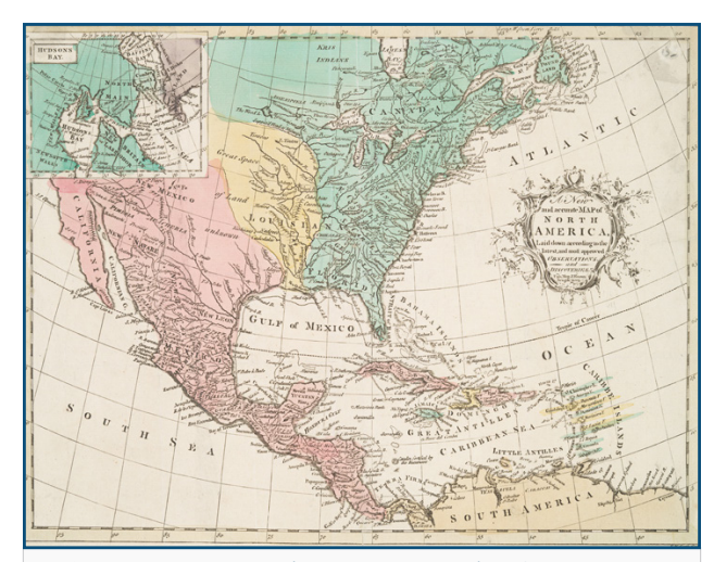
1763 map of European claims to North America. Courtesy of the Lionel Pincus and Princess Firyal Map Division, The New York Public Library (483704). To access a digital image of this map, go to <a href="https://digitalcollections.nypl.org/items/510d47db-c2e5-a3d9-e040-e00a18064a99">https://digitalcollections.nypl.org/items/510d47db-c2e5-a3d9-e040-e00a18064a99</a>.

These new regulations annoyed some colonists more than others. For example, in 1763, the British government proclaimed that British colonists could not claim land west of the Appalachian Mountains. This Proclamation line attempted to reduce violence between colonists and the hundreds of Indigenous nations who lived in North America. When the British government argued that colonial settlement in the west was illegal, it frustrated trans-Appalachian speculators, such as George Washington, who wished to sell land legally to other European settlers. Nonetheless, colonial squatters simply took the land, in defiance of both the wealthy proprietors who claimed it and the British army that was supposed to enforce the ban.