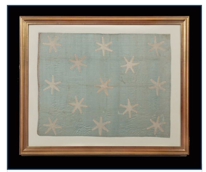
Washington's Headquarters Flag, 1777–1783, Museum of the American Revolution. You can access an image of this artifact here: <a href="https://www.amrevmuseum.org/collection/washingtons-headquarters-flag">https://www.amrevmuseum.org/collection/washingtons-headquarters-flag</a>.

During World War II, the U.S. government created a poster to encourage and inspire Americans on the homefront to serve their country. Alongside images of modern troops, it featured the phrase "Americans will <u>always</u> fight for liberty," images of Continental Army soldiers, and the flag that is believed to have flown at George Washington's headquarters and to have traveled with him on the field. This poster can be seen online in the Museum's <u>Multimedia Timeline of the American Revolution</u>.