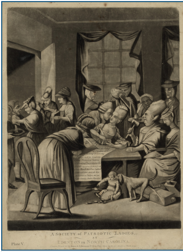
British satirists mocked women's participation in boycotts. In this image, a non-housebroken dog licks a baby left neglected under the table. To access a digital copy of this image, go to <a href="https://www.loc.gov/item/96511606/">https://www.loc.gov/item/96511606/</a>.

The British ministry reacted angrily to these protests and boycotts. The ministry passed another series of acts, referred to as the Intolerable or Coercive Acts, intended to punish Boston and force the colonists to pay for the destruction of the tea. The goal of isolating Massachusetts was unsuccessful. Instead, colonial legislators sent representatives in September 1774 to meet in Philadelphia as the First Continental Congress. Far from seeing themselves as Americans at that point, the representatives declared that they were entitled to the "rights, liberties, and immunities of free and natural-born subjects of England." As such, they insisted that British Parliament did not have the right to collect taxes without their representation in government. The Continental Congress authorized local associations to enforce more boycotts on British goods.