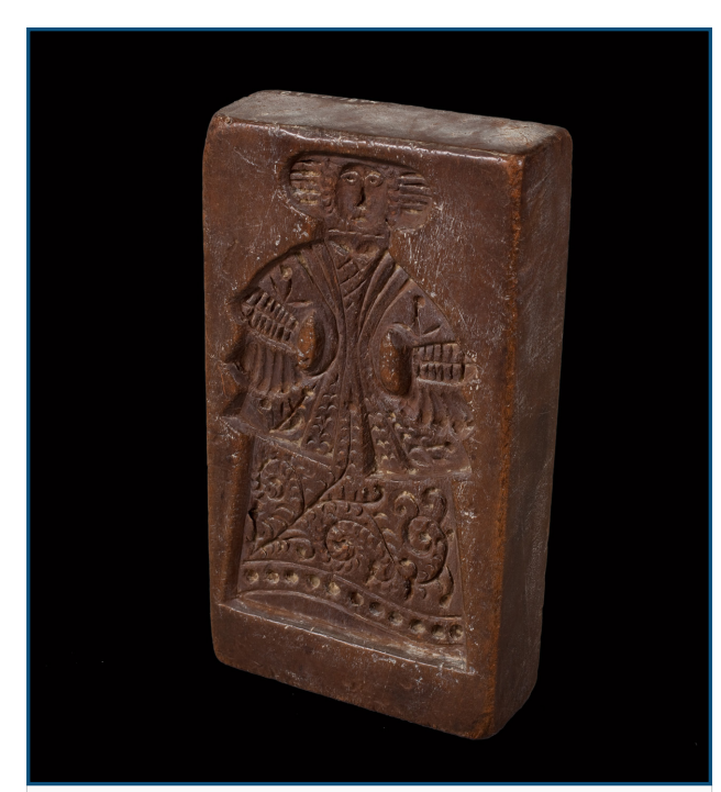
Christopher Ludwick's Cookie Board, 1754–1801, Museum of the American Revolution. Access an image of the artifact at <a href="https://www.amrevmuseum.org/collection/christopher-ludwicks-cookie-board">https://www.amrevmuseum.org/collection/christopher-ludwicks-cookie-board</a>.

As historians have often taken the Revolutionaries at their word, the perception of these soldiers as mercenaries has persisted for over a century, but new analysis suggests that these men had much less control over their circumstances and benefitted much less than one might assume a soldier of fortune would.<sup>6</sup> Interestingly, some even chose to desert their armies and blend into local German communities in the colonies, hoping life here would offer them a better chance at freedom. German immigrant Christopher Ludwick, a baker and confectioner who became Baker General of the Continental Army, was personally involved in recruiting them and even caring for German prisoners of war. What did the dream of freedom, liberty, and equality mean for them, and for Ludwick, as a more established immigrant?<sup>7</sup>